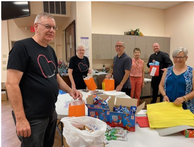
August Birthday Bags

As you can see, even though it is summer and our numbers are fewer, our work goes on. Please keep supporting our outreach efforts in any way that you possibly can!