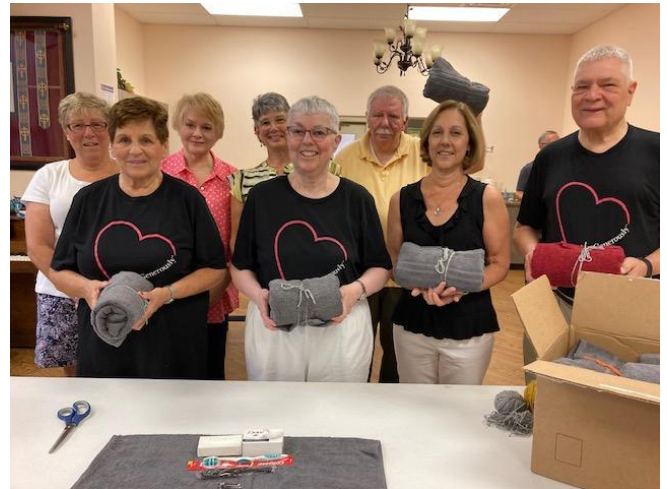
LWR Personal Care Kits